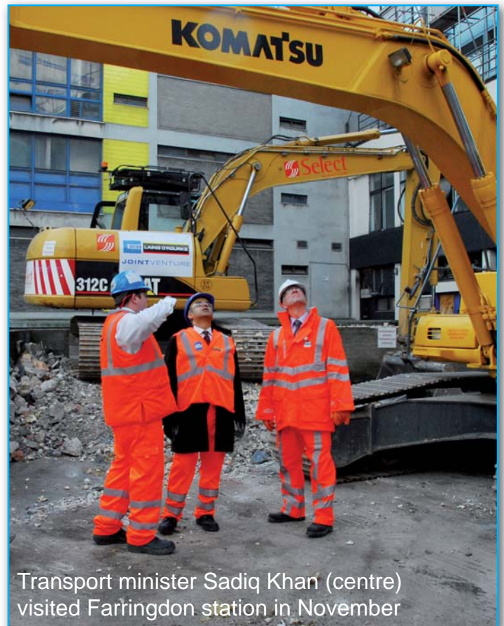
Transport minister Sadiq Khan (centre) visited Farringdon station in November

Mr Khan said he was pleased to see the work well underway to make the Crossrail vision a reality 'and translate the government's multi-billion pound investment into better services for people travelling through London and the wider UK'.